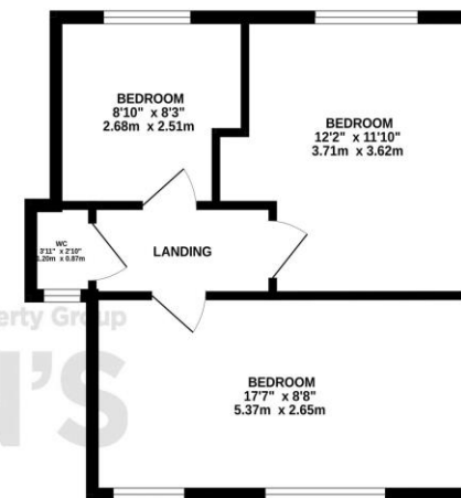
1ST FLOOR 393 sq.ft. (36.5 sq.m.) approx.